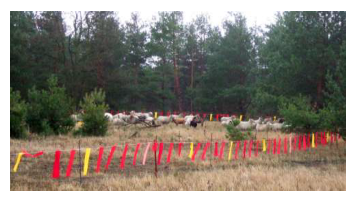
Figure 2 – Fladry as an acute measure after a wolf attack. The fladry was drawn around an electric sheep net that was jumped over before (Photo: I. Reinhardt).

as night corrals (Poland). In other countries their use is not recommended (Switzerland, Italy/Piemonte, Slovenia) or only in combination with livestock guarding dogs (France). In Spain a massive mesh wire fence 200 cm in height with barbed wire on top was tested in the frame of LIFE - COEX. This fence is dug an additional 50 cm into the ground and has proved to be 100% safe against wolves or stray dogs (LIFE - COEX C6, 2008). In Saxony non electric fences are recommended to be at least 120 cm, preferably 140 cm, in height with a protection against digging (defined minimum prevention standard, see above). In Germany this kind of fence is in general only used on small pastures in where people graze just a few sheep as hobby and on a permanent basis.