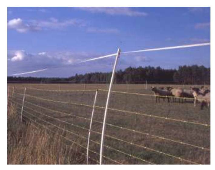
Figure 3 – White cord stretched 20–30cm over the electric net fence to keep wolves from jumping over.

Several projects clearly confirmed the effectiveness of LGDs. The LIFE - COEX project provided 245 LGDs mainly to shepherds in Portugal (92), Spain (75) and Italy (78). In Portugal the damages decreased in 72% of these farms and the overall reduction in damages averaged 27% (13–100%), with an average of 11.08 animals killed per flock per year before and 6.36 animals killed after adult LGDs were integrated. In Spain the number of attacks on flocks decreased by 61% per year after the dogs were introduced (2.4 attacks / holding / year before dogs, 0.9 attacks / holding / year after dogs), and the total number of animals killed decreased by 65% (15.1 / year / holding before dogs, 5.3 / year / holding after dogs) (LIFE - COEX 2008 - Report Action D2).